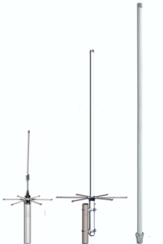
GP Antenna GP Antenna GP Antenna SG101N-915 SG104N-915 SG105N-915