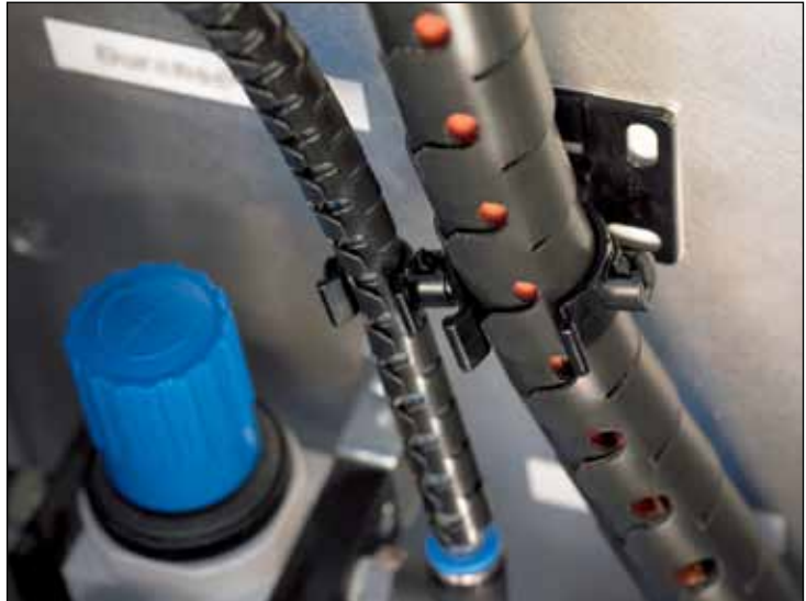
For example: The protection and affixing of cables in a wiring cabinet with Helwrap sleeving.