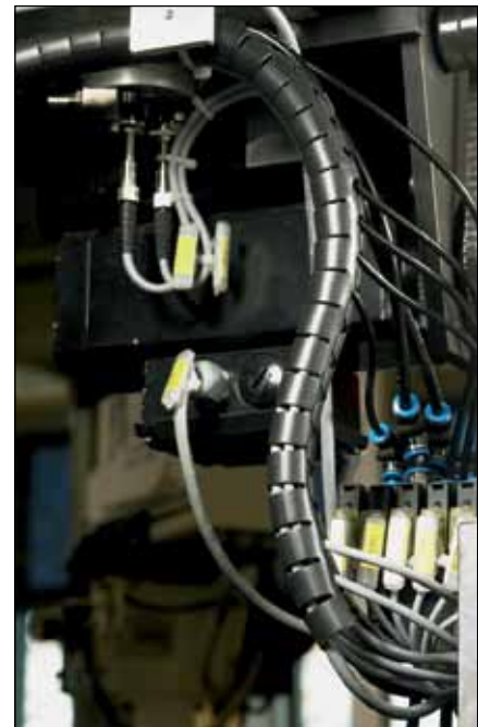
Cables can be branched off at any point for better, more flexible protection.