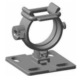
For secure hold, R1 loop can be used (for HWClip25 and HWClip30 only).

Use Part No. for ordering and Type for specification purposes.