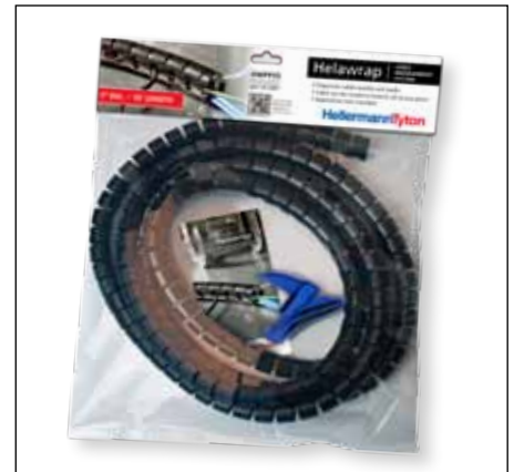
Helawrap convenience packs are available in two sizes, 5/8" and 1" diameter.