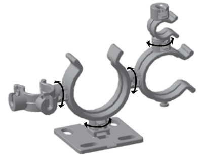
Multiple clips can be joined. Clips swivel freely.

Each clip size sits snugly around the corresponding Helawrap sleeving and holds it firmly in place. With an innovative coupling system, each clip is to be joined to a mounting plate or another clip of any size. Many clips can be linked together and each can turn freely. As a result, any number of differing cable sizes can be bundled together.